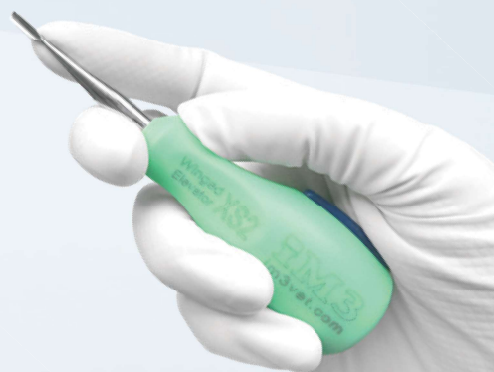
iM3 Ergo Winged Elevator XS

If the width and or length of your hand fits inside the GREEN area we recommend the Ergo XS (green handle/purple handle). If your hand extends into the BLUE area, then choose the standard Ergo Elevators (blue handle).